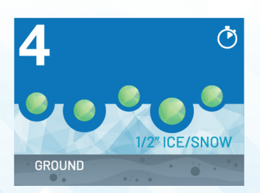
In 10 minutes, Safe Thaw granules bore through ice, destabalizing it.